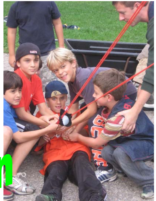
(Right) – Big Horn Tribe members taking aim during the water balloon launch contest