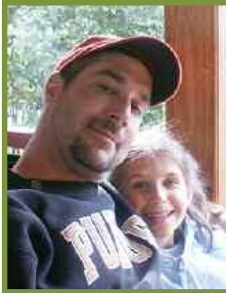
Broken Arrow & Rose Petal on Old #73 from Skagway, AK to the Yukon this past summer.

See our web site for additional event dates and times.